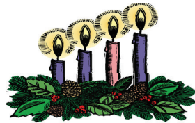
Fourth Sunday in Advent